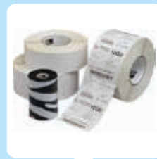
Consumables (labels, ribbons, PVC cards)