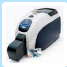
PVC card printers